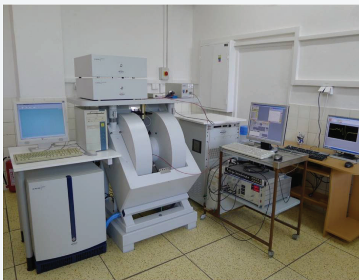
EPR spectrometer EMX-Plus, X- and Q-band