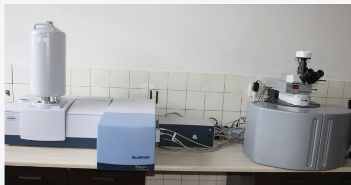
Raman spectrometer MultiRAM with microscope RamScope III