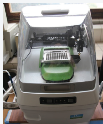
DSC calorimeter DSC 8500